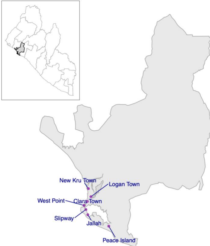
Supplementary Figure 2. Map of Select Slum Communities in Montserrado County. Montserrado County is one of 15 counties in Liberia (insert) and includes the capital, Monrovia.

** Underreporting in the census for slum community populations has been recognized.[29] We adjusted by a factor of 2.5 to achieve population sizes more consistent with local estimates, although it is possible the adjusted populations remain underestimates.