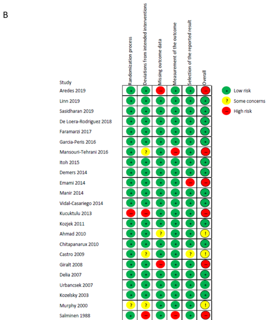
1 Figure S2 Risk of bias summary for all studies that met the inclusion criteria 2