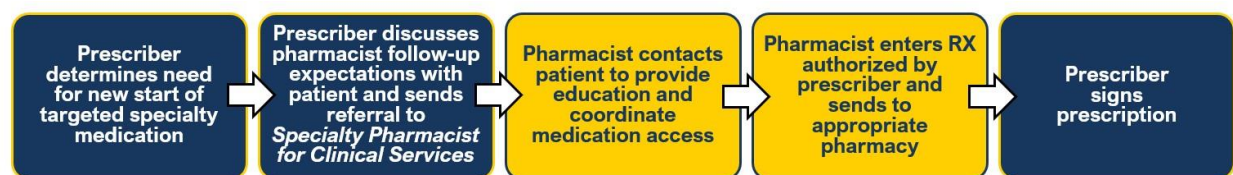
Figure 1. Intervention process for medication access. Multiple roles were involved throughout the prior authorization and medication access process. The pharmacist is involved prior to prescription completion.

Specifically, when the prescriber identifies the need for initiation of a qualifying specialty medication, they send a referral to a clinical specialty pharmacist in lieu of a prescription. Within the referral, the prescriber indicates the preferred medication name, dose, and frequency. After receiving the referral order, the pharmacist contacts the patient to provide telephonic clinical education and coordinate medication access in partnership with medication access staff. The medication access team completes benefit investigation, submits prior authorization, coordinates financial assistance, and identifies and documents the patient's preferred or required network pharmacy within the medical record. The pharmacist then enters a prescription order for the specialty medication and pends the order for prescriber signature. In some cases, the medication needs to be changed following benefit investigation, which is also recommended by the pharmacist. Once resolved, the prescriber then reviews and signs the prescription order, releasing it to the appropriate pharmacy for fulfillment.