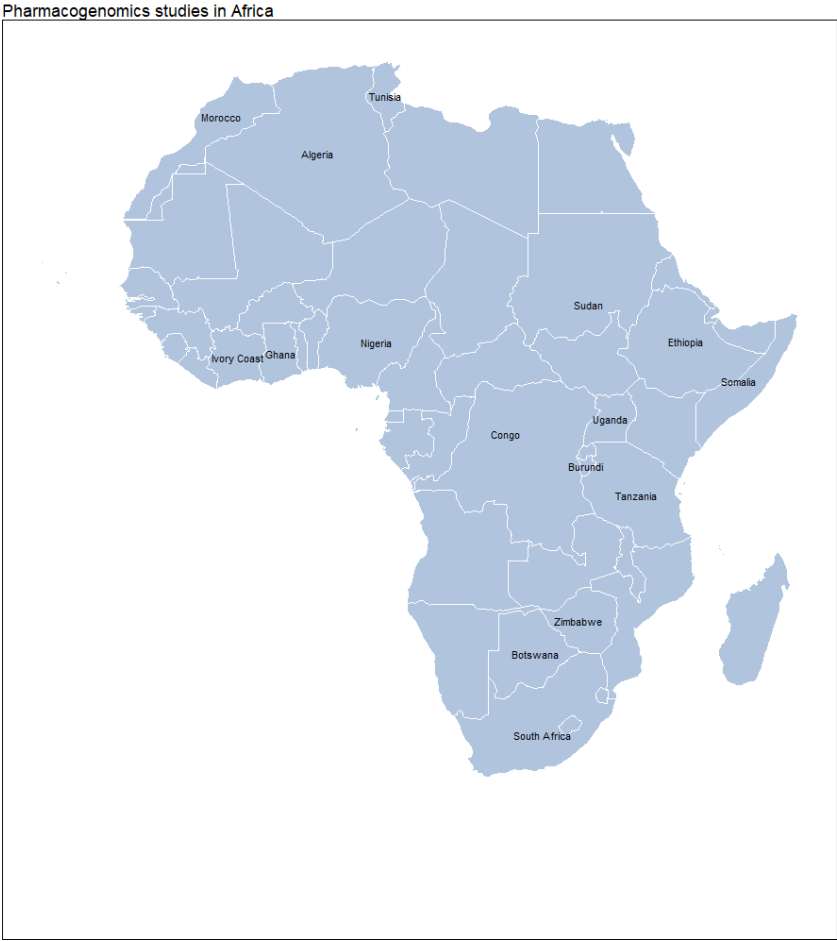
Fig. 3. Countries in Africa where psychiatric pharmacogenomic studies have been conducted.