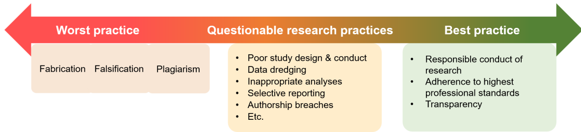
Figure 1. Research integrity continuum ( adapted from Steneck ) 2