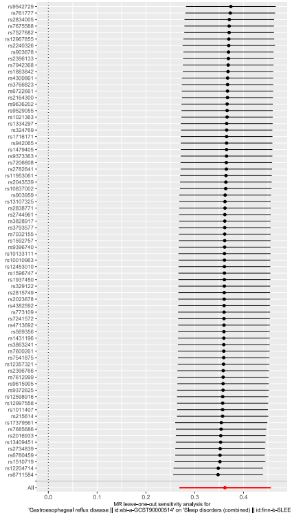
(A) sleep disorders