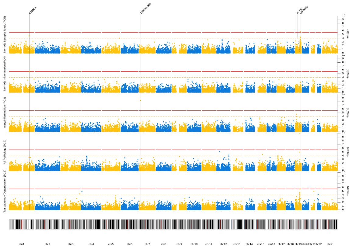
Figure S3: Manhattan plot (gene-based tests). Results from GWAS of five CSF biomarker PC across both sexes. Each row represents a different PC as outcome. X-axis represents each SNP and the y-axis the p-value of the gene-based association derived with MAGMA on a -\log_{10} scale. All analyses were adjusted for sex, genetic ancestry, and SNP array. Red line indicates genome-wide significance threshold ( p=2.3 \times 10^{-6} ). Yellow line indicates suggestive threshold ( p=1 \times 10^{-4} ). Vertical lines point towards genome-wide significant loci based on any model. P-values below 1 \times 10^{-10} were winsorized to 1 \times 10^{-10} .