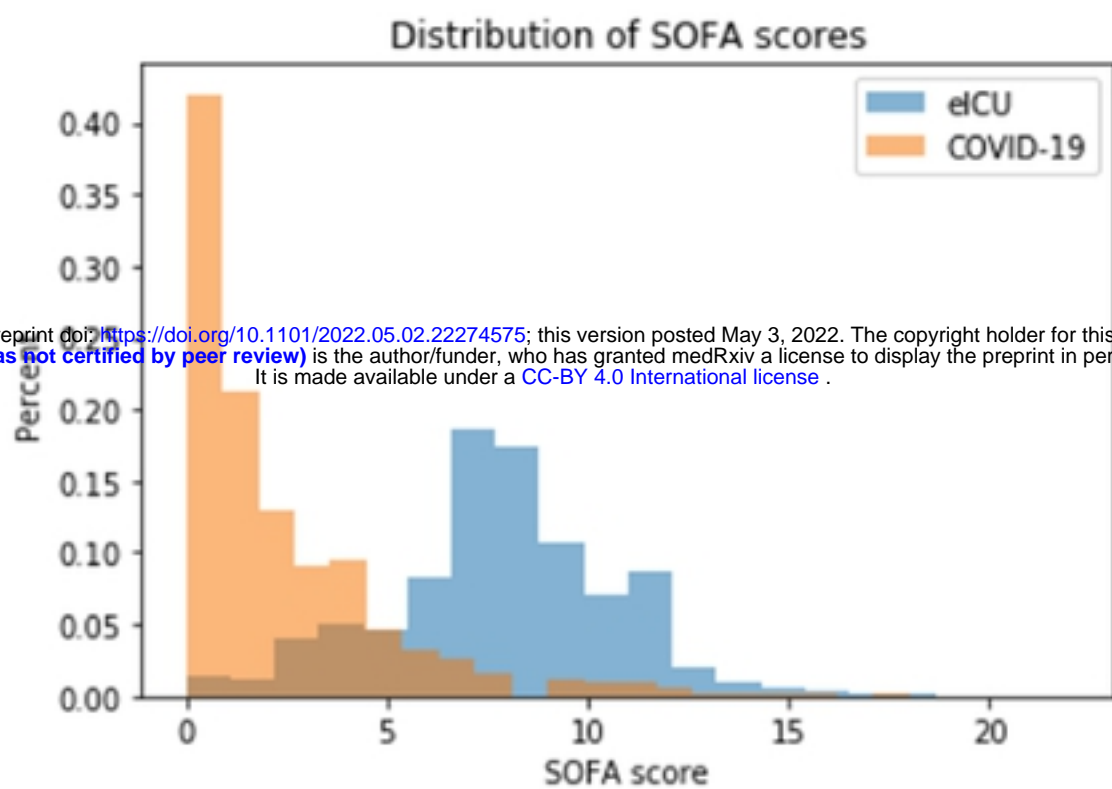
Figure 1 (Distribution of SOFA Scores):

medRxiv preprint doi: https://doi.org/10.1101/2022.05.02.22274575 ; this version posted May 3, 2022. The copyright holder for this preprint (which was not certified by peer review) is the author/funder, who has granted medRxiv a license to display the preprint in perpetuity. It is made available under a CC-BY 4.0 International license .