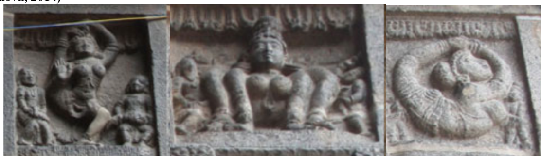
Figure 1: Joint Hypermobility Depicted on the Rajarajeshvara temple in Tanjore Built circa 1000CE, Tamil Nadu, India (Bennink et al, 2013) and described in the Natya Shastra written approximately 500BCE (Lidova, 2014)

Rombaut et al. , (2015) conducted a survey of 325 physiotherapists in Sweden, of whom 74.6% reported they had never conducted an assessment on a patient with Generalised Joint Hypermobility (GJH), or Hypermobile Ehlers Danlos Syndrome (H-EDS). Another survey by Palmer et al. , (2016) surveyed 66 physiotherapists and reported the majority had not received any formal training in management of symptomatic joint hypermobility and had seen only 10, or fewer patients with GJH in the prior year. This discrepancy between prevalence and recognition in a clinical setting remains an ongoing issue for patients and healthcare professionals alike.