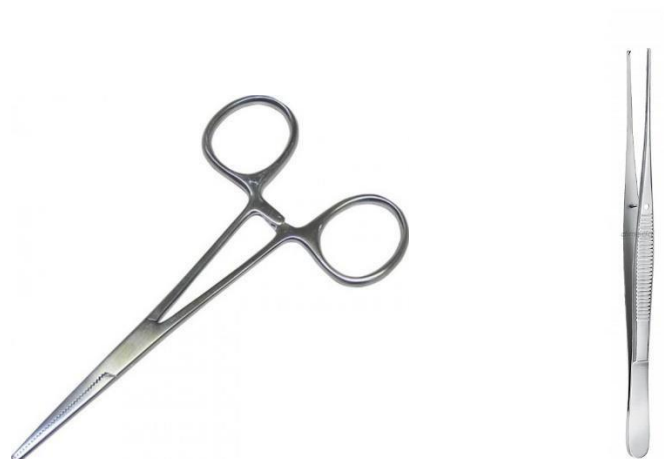
Figure 3 Sterile tools

the most. In the testing phase, they were always expected to detect a new Covid-positive target sample in each battery. In this study, we have used a total of 228 samples, of which 156 positive and 72 negative for the presence of the SARS-CoV-2 coronavirus.