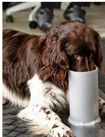
Figure 6 Identifying a positive sample