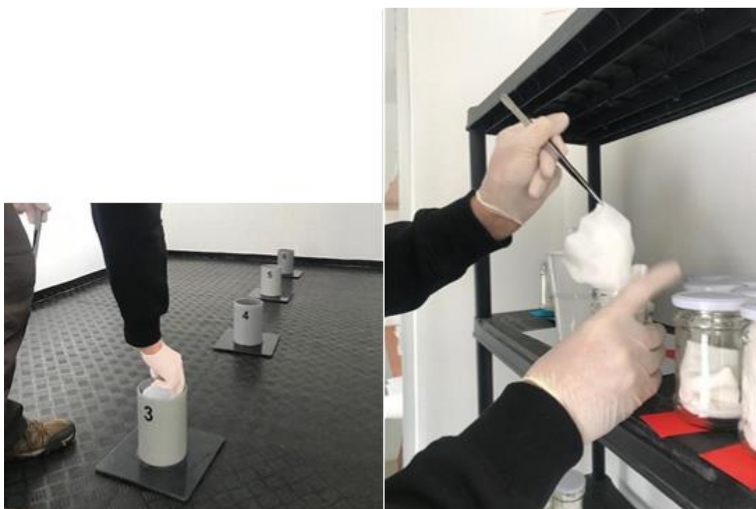
Figure 5 Preparing the samples

Each testing battery comprised the same representation of samples, that is, one Covid-positive sample, one Covid-negative sample and four neutral samples. It was only the order of the samples that changed for each tested dog. The coach never knew the composition and placement of the samples. He was warned by an acoustic signal when the detection was correct. The dogs received a standard reward for detecting the sample correctly. Out of a total number of 100 detected samples, the dogs correctly identified the positive samples in 95 cases. Of the total number of 100 detected negative samples, they only identified six. The reasons why the dogs did not identify the positive samples but the negative ones are subject to further research. Unfortunately, it was not possible to subject the donors of samples that were detected erroneously to another PCR test. All experiments were carefully registered and recorded to enable a further analysis.