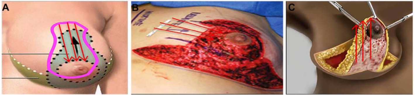
Fig. 2: The Pedicles. A. Superior pedicle mammoplasty, B. Superomedial pedicle mammoplasty, C. Inferior pedicle mammoplasty.