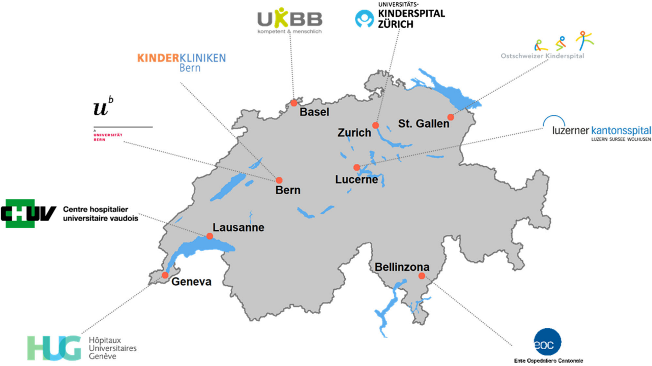
Figure 1: SwissPedData taskforce