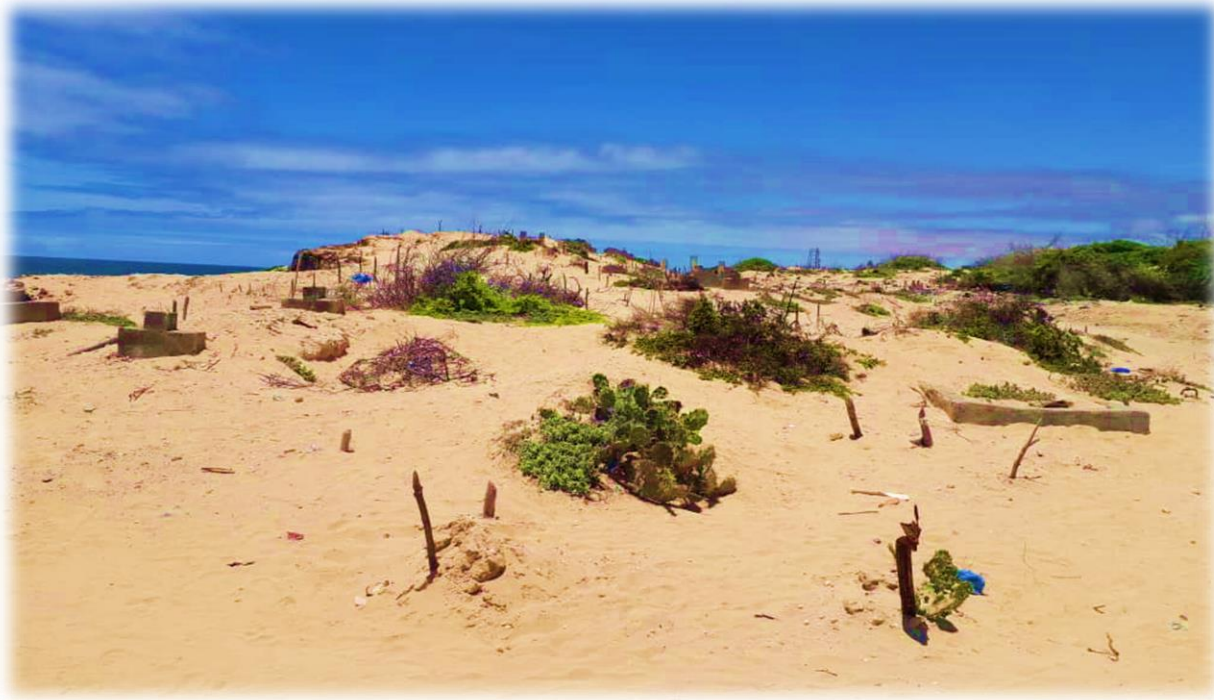
Figure S4. School Policio Cemetery