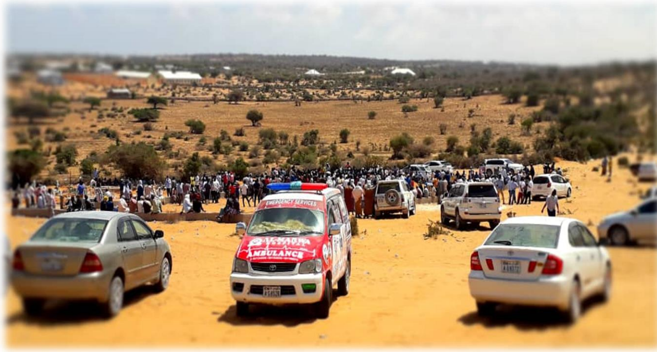
Figure 1 Burial gatherings during the COVID19. When person dies regardless of the cause people gather and pray for the deceased.