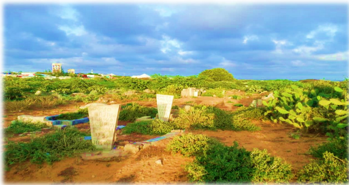
Figure S3. Moalim Nuur Cemetery