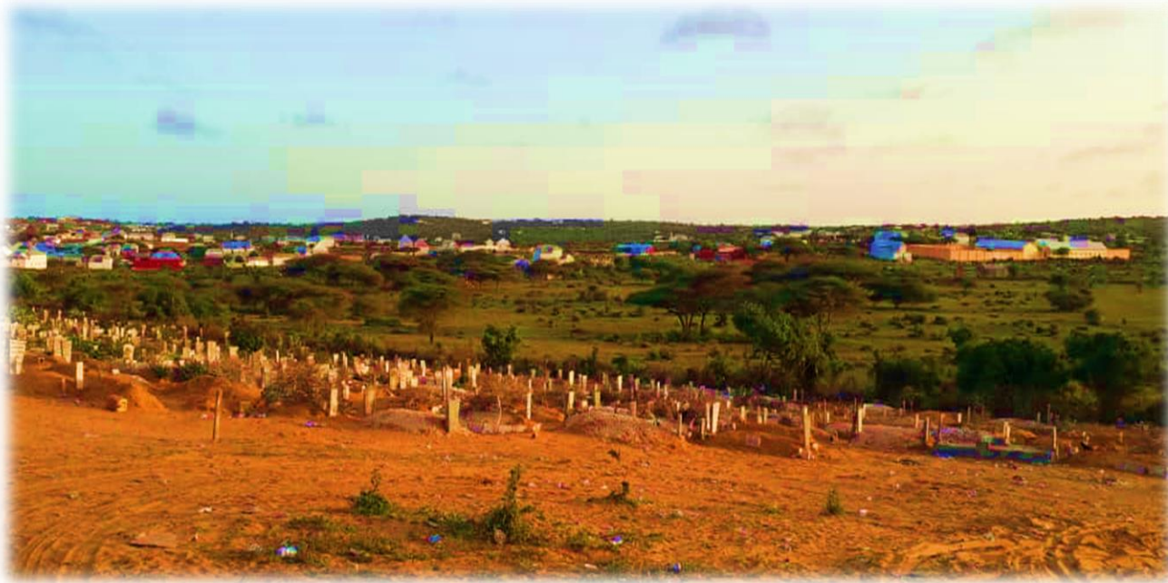
Figure S6. Kaxda Cemetery