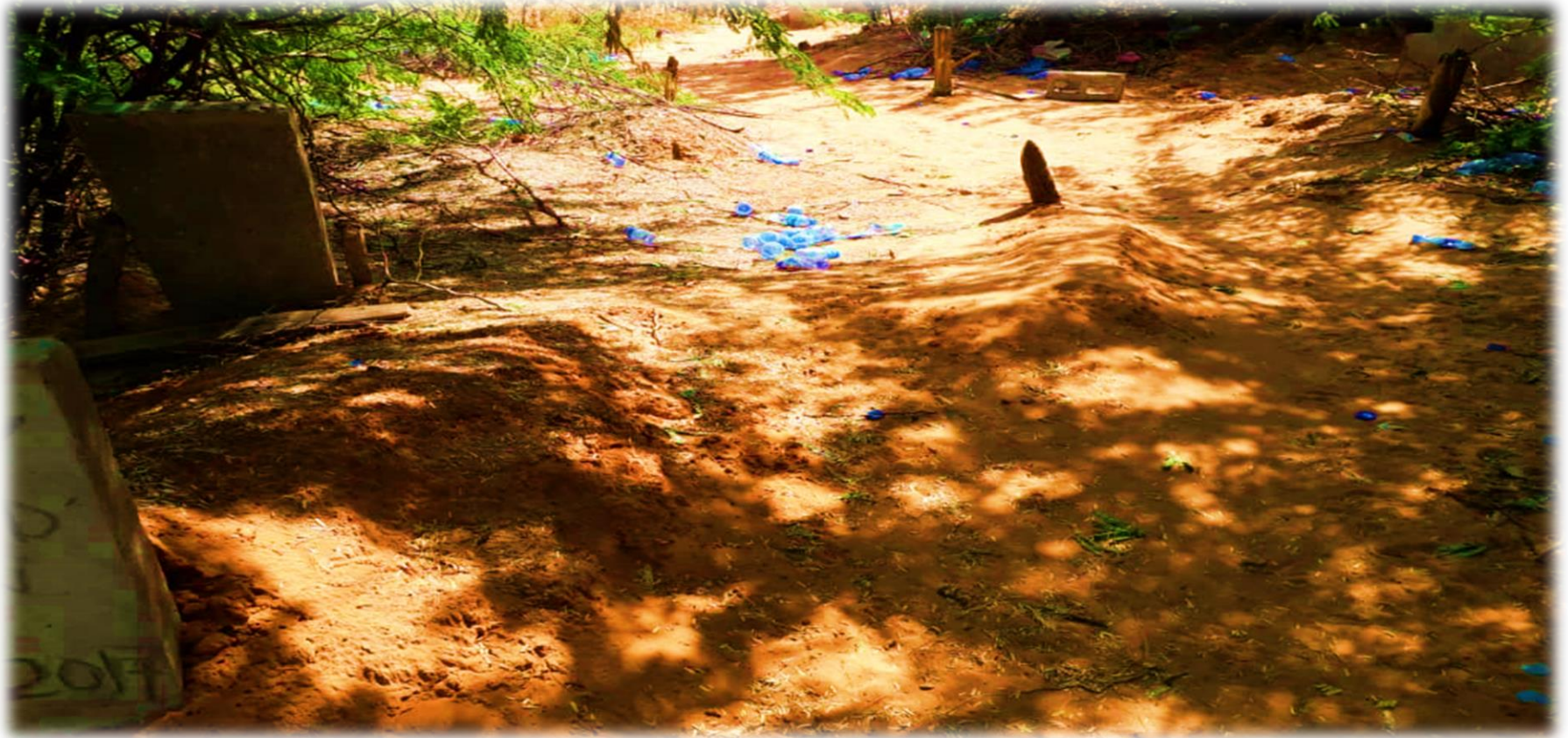
Figure S7. A group of graves covered by trees in Abay Dhahan Cemetery