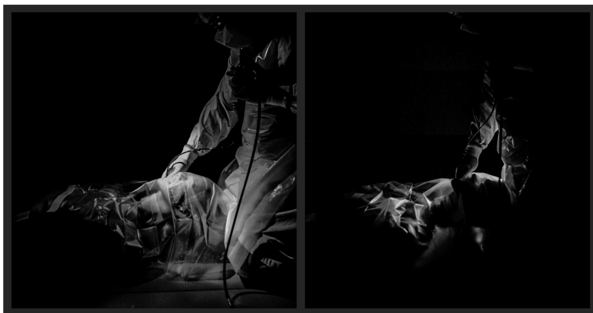
Fig. 6: Protection from potential aerosol spread during upper endoscopy by using a covering drape.

Figure 6 highlights the aerosol spread during endoscopy with a covering clear drape. Aerosol was deflected and could not be detected near the investigator's face.