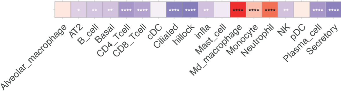
Cell types associated to bacteria (COVID-19)