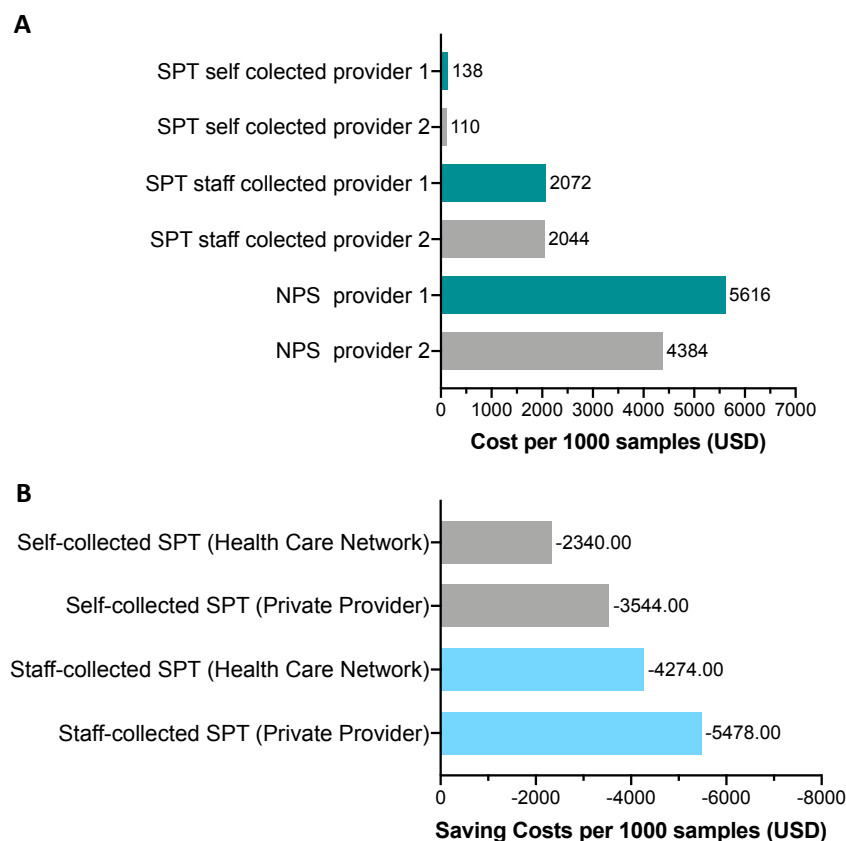
Figure 3. Comparison of costs of using SPT under clinical settings for diagnostics of SARS-CoV-2. A. Analysis of actual cost of obtaining SPT versus NPS samples through two different health network providers. B. Calculated cost reduction of collecting SPT versus NP specimens through a health network versus a private provider. Analyses performed considering 1,000 samples under different health services.