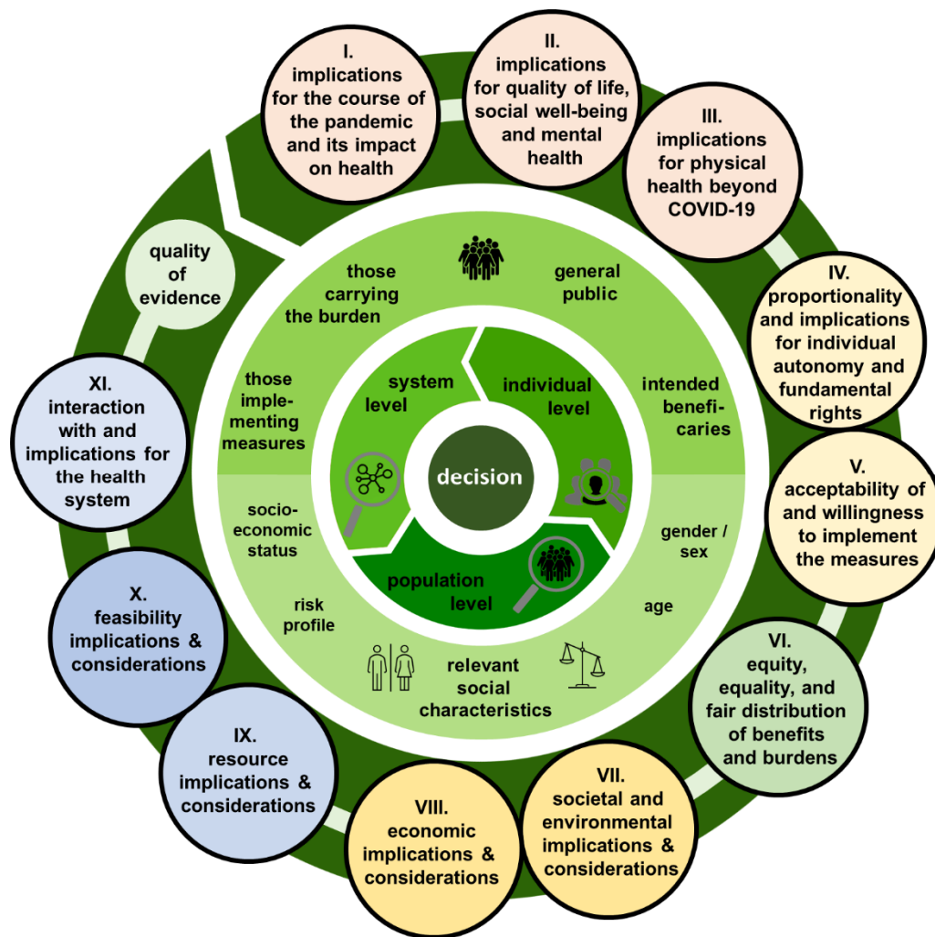
Figure 1: WICID Framework version 1.0

The color of the 11+1 criteria of the WICID refers to their grouping and relation to the criteria of the WHO-INTEGRATE framework they are derived from. The center-most circle describes population groups onto which the criteria and aspects should be applied to. The inner most circle describes the perspective the decision makers can take onto criteria and populations.