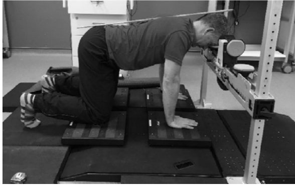
Figure 1. Simulated test position adopted for the assessment of neck strength in the ForceFrame™ testing rig.