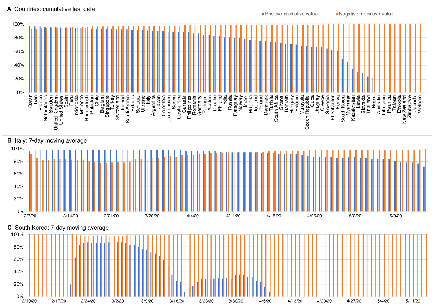
Figure 2. Reliability of SARS-CoV-2 test results in different countries. Positive predictive value (the probability that a positive result is true) and negative predictive value (the probability that a negative result is true) calculated with a false negative rate of 25% and a false positive rate of 0.8%. (A) Results for 77 countries based on cumulative test data through the most recent available date (between April 29 and May 14, 2020). Countries arranged left to right in order of decreasing test positivity. (B-C) Reliability trajectories based on the previous-7-day moving average for countries with positive test results with declining reliability (Italy) and sharply declined reliability (South Korea). Cumulative test data are from Our World in Data ( https://github.com/owid/covid-19-data/tree/master/public/data/ accessed May 14, 2020). Daily test data are from the Italian Ministry of Health ( http://www.salute.gov.it/portale/nuovocoronavirus/archivioNotizieNuovoCoronavirus.jsp?lingua=italiano&menu=notizie&p=dalministro&area=nuovocoronavirus&notizie.page=0 accessed May 14, 2020) and the South Korean Centers for Disease Control and Prevention ( https://www.cdc.go.kr/board/board.es?mid=&bid=0030 accessed May 14, 2020).