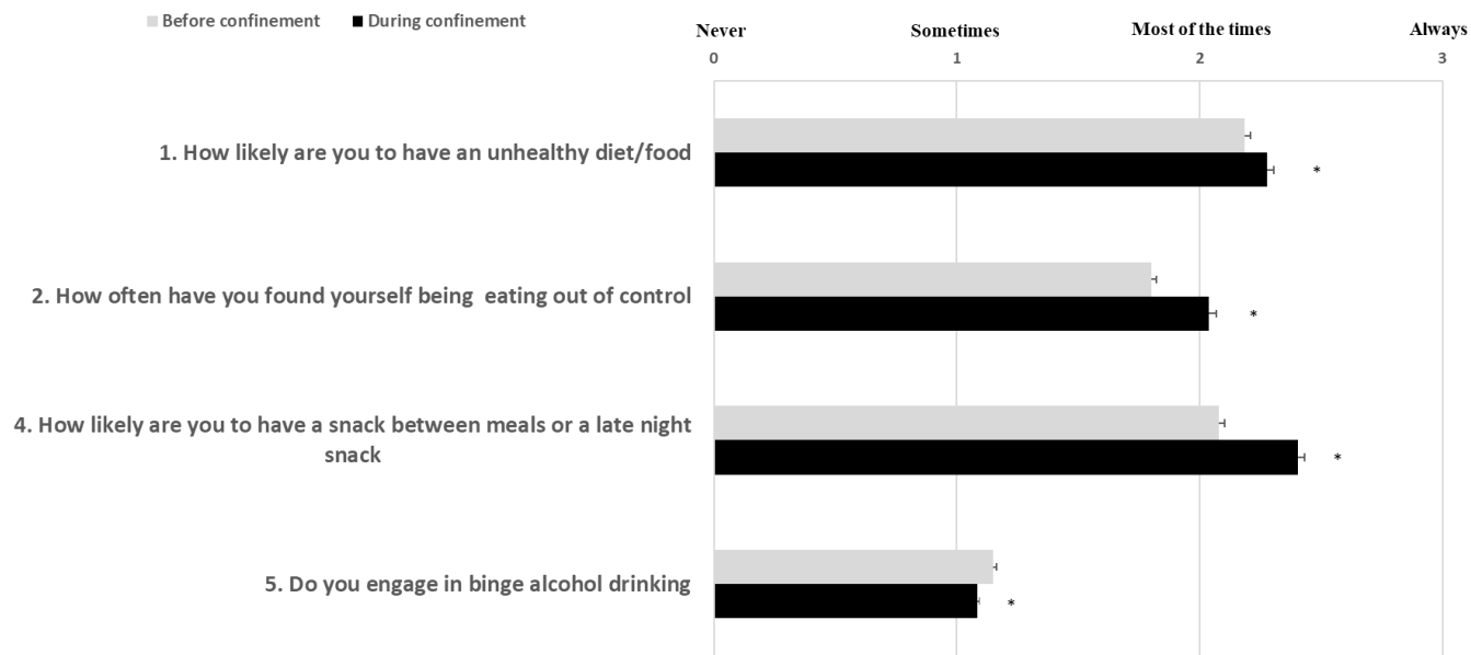
Figure 1: Participants' scores in response to the related-diet behaviors' questions