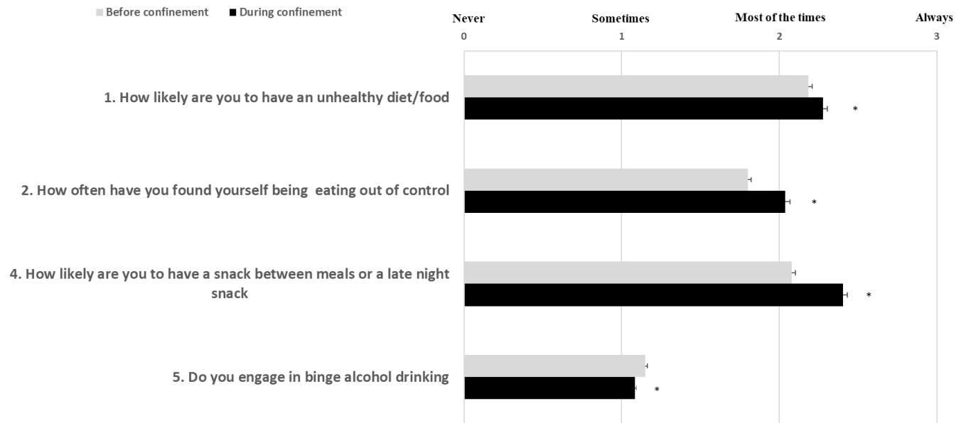
Figure1: Participants' scores in response to the related-diet behaviors' questions