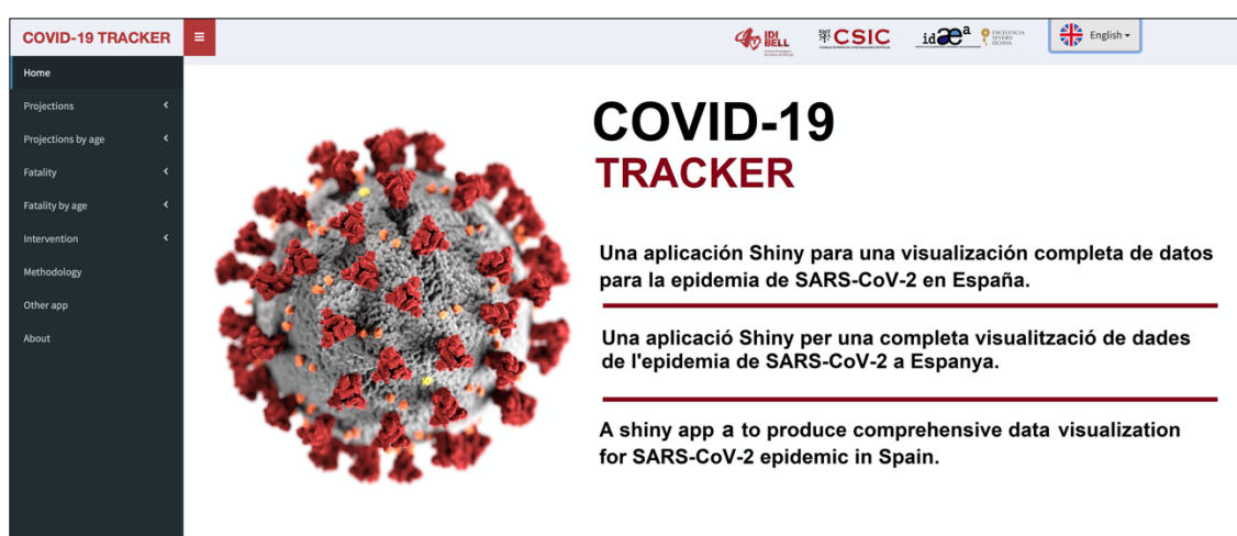
Figure 1. Home page of the COVID19-Tracker application, for visualization and analysis of data from the SARS-CoV-2 epidemic in Spain. Available at: https://ubidi.shinyapps.io/covid19/

We also introduced two additional menus to describe the Methodology , reporting the statistical details on the analyses already implemented, and Other apps , which collects applications also developed in Shiny by other users to follow the COVID19 epidemic in Spain and globally.