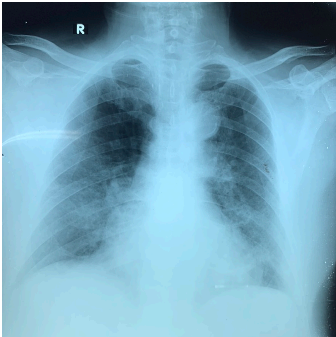
Supplementary Figure 1: Chest radiograph taken on admission (January 31 st , 2020) showing bilateral infiltrates