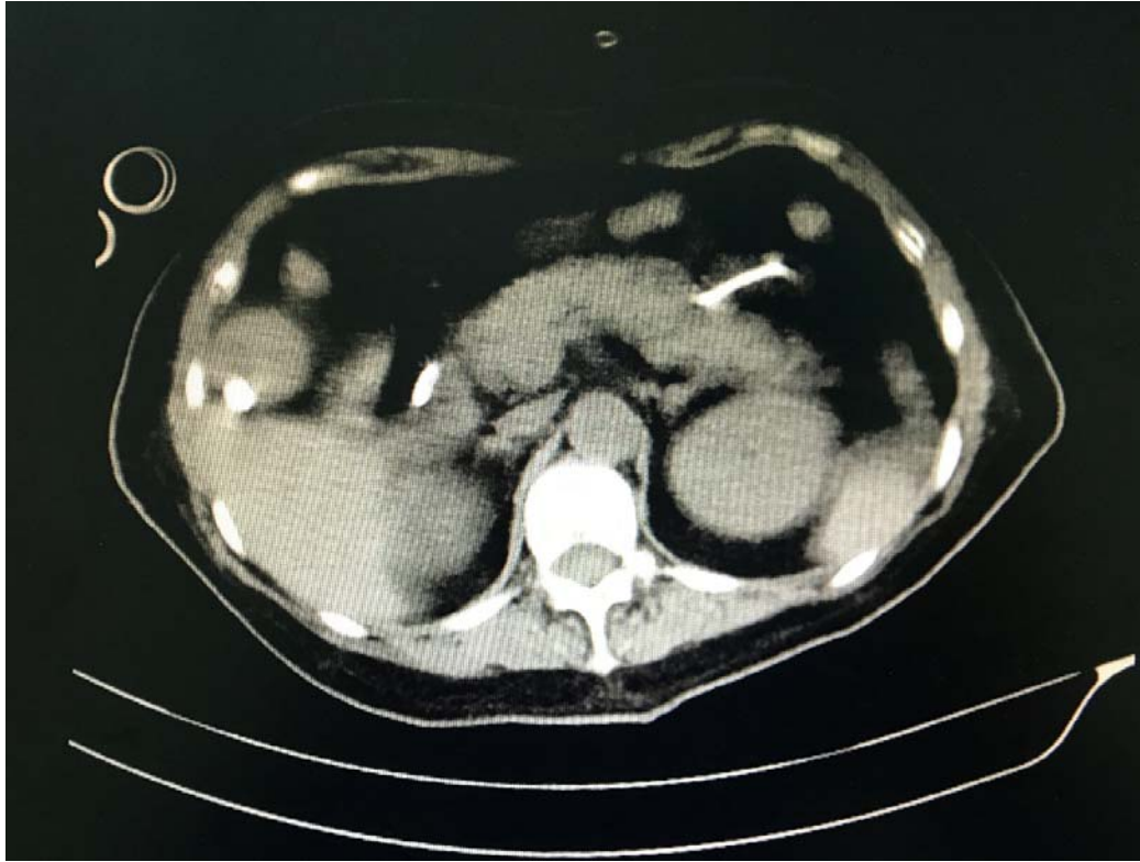
Figure 2. This CT scan shows an enlarged pancreas with dilated pancreatic ducts in a severe patient with COVID-19.