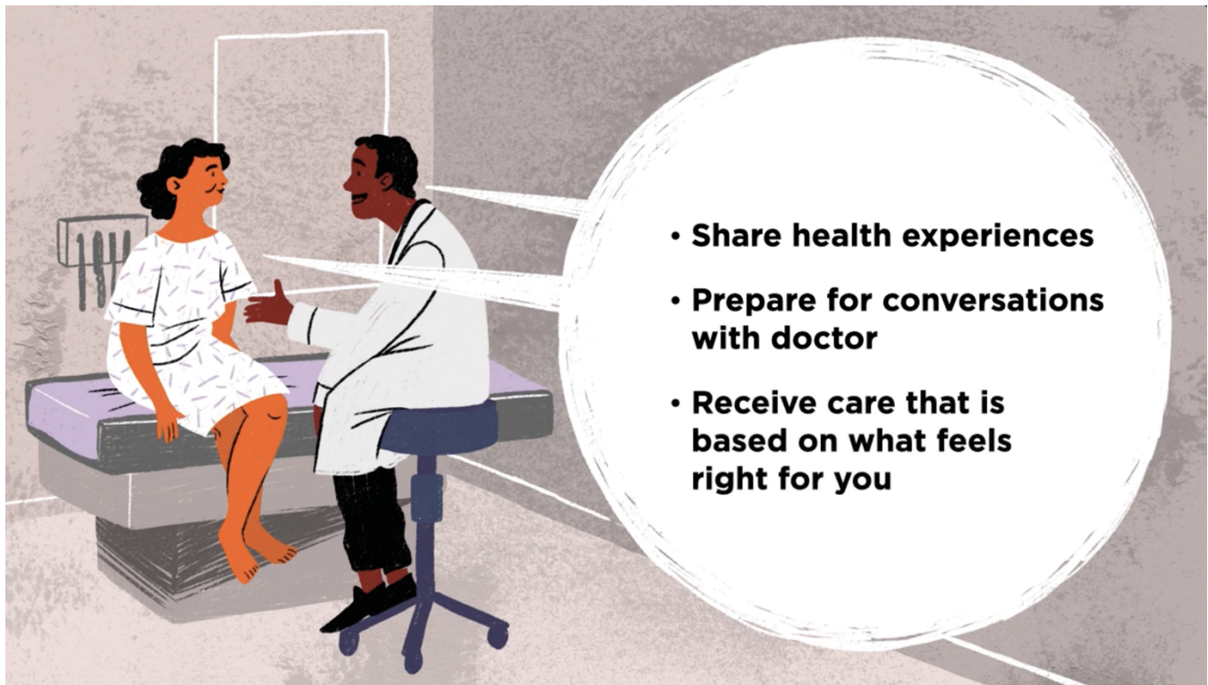
Figure 1. The sessions were introduced by a brief video , highlighting what to expect from the session as well as the goals of the sessions: to share health experiences, prepare for conversations with their doctor, and to promote care that feels right for them.

(Supplement 1). Following each session, we invited informal (not anonymous) and formal (survey-based; anonymous) feedback; unfortunately, we had very few surveys returned and cannot include these data as part of the evaluation. In total, 12 sessions were conducted with 93 women.