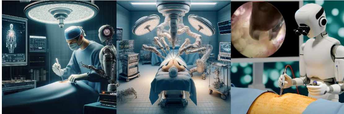
Figure 3. Three kinds of robotic SES generated by DALL·E 3 model.

miles away. During automated-robot phase, the surgical robot is expected to make preoperative surgical plans and conduct the operation on its own, while the surgeons are far more like the supervisors. These scenes are not far away, while humanoid robots have already come into our life and doing housework on their own(11).