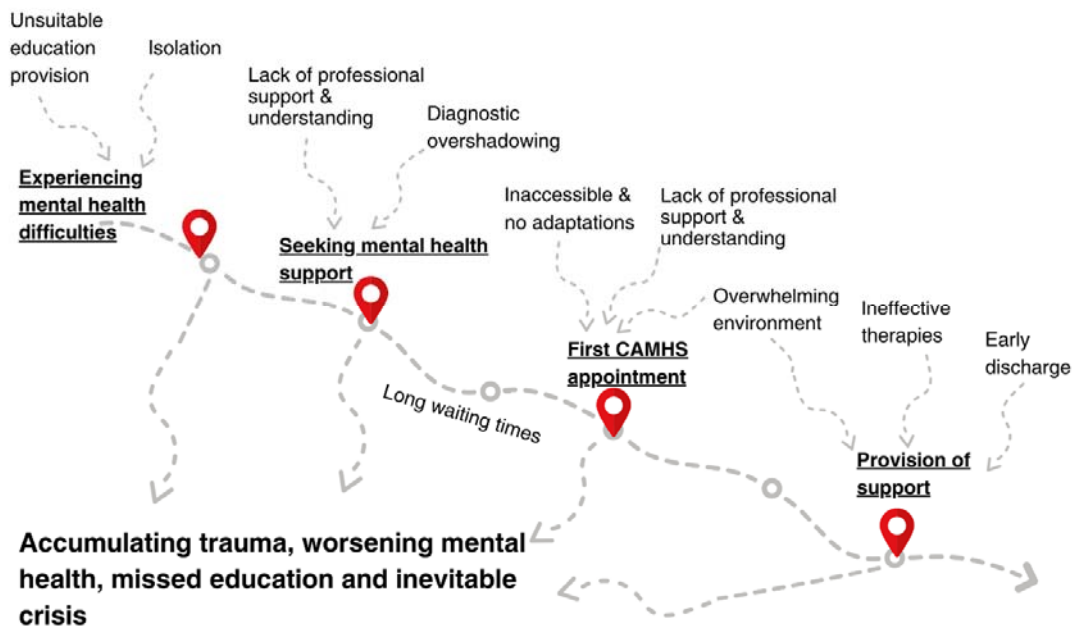
Figure 1. A summary of findings