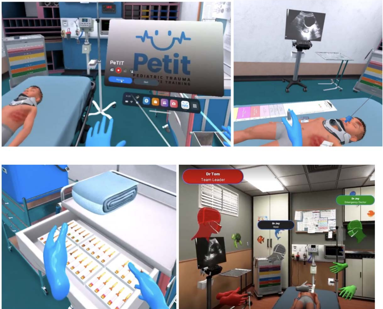
Figure 1. PeTIT VR

This study seeks to examine face and construct validity and represents the initial phase of an extensive research agenda. The platform has been used for research purposes and is not currently commercially available.