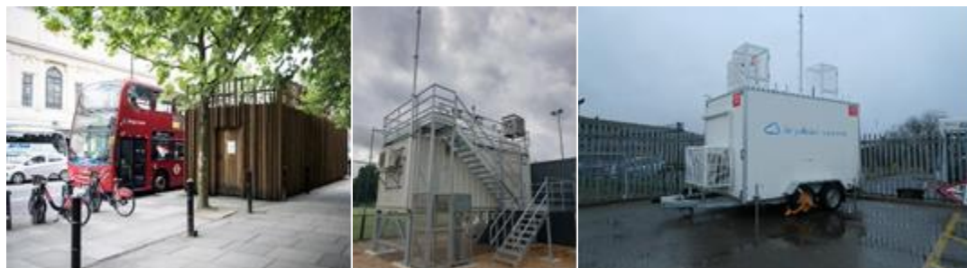
Figure 2: Air quality supersites: Marylebone Road (left), Honor Oak Park (centre), mobile measurement station (not in location).

measurement capability as the supersites. This location provides the contrast in non-exhaust contributions, being next to the high speed A40 flyover.(Figure 2).