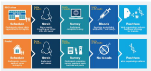
Figure 1: Diagram outlining the SIREN participant journey.

Legend: SIREN participant journey and study visits, divided by testing pathway. The top pathway describes the journey for participants at NHS sites; the bottom pathway describes the journey for participants at home via the postal pathway.