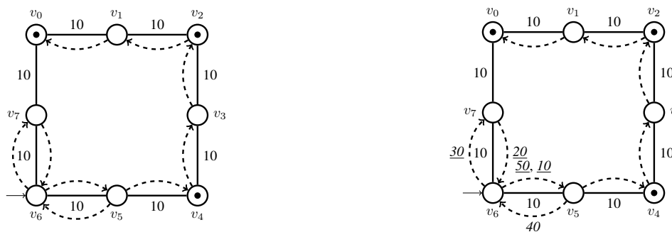
(a) An unsuccessful game, in which the seeker's backtracking ( \langle v_5, v_6, \dots, v_7 \rangle , with an additional cost of 40) makes their total cost (100) more than that of the total edge cost (80). (b) A successful variant of the game shown in Figure 2a. Gas starts at 50 ( v_6 ) and is depleted when v_5 is revisited, but reduces costs to 50, which is less than the total edge cost (80).