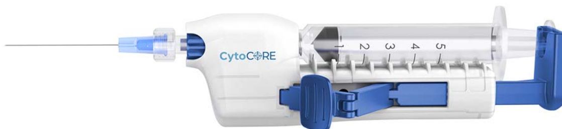
Figure 1. The CytoCore® motorized, rotating fine needle biopsy device.