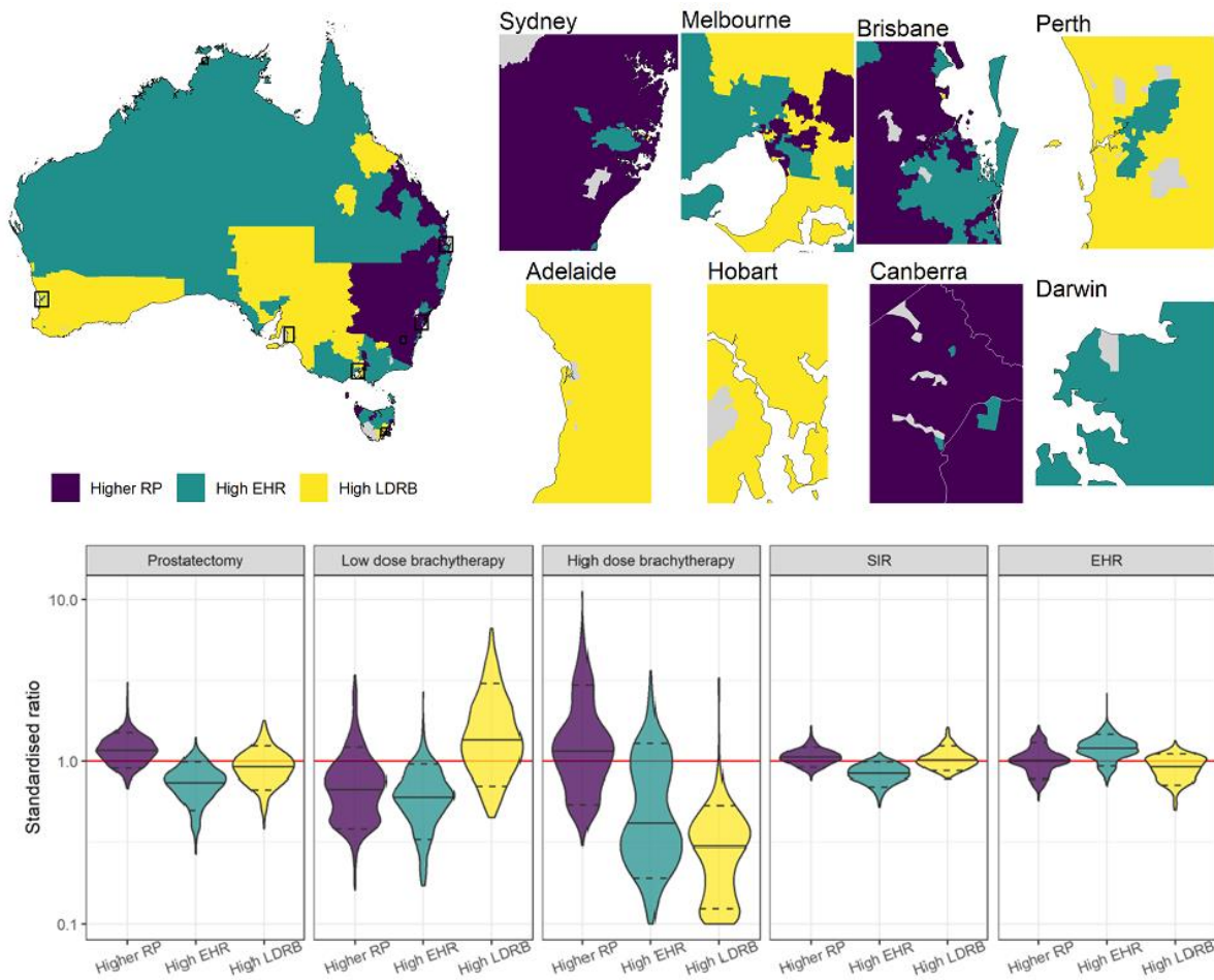
Figure 3; Maps showing the geographic distribution of the three statistical groups (indicated by colour), insets showing the statistical groups for the State and Territory capital cities and violin plots showing the distribution of standardised rates for each of the treatments, diagnoses (“SIR”) and excess deaths (“EHR”) by statistical group. The groups have been labelled “higher RP”, “high EHR” and “high LDRB” reflecting the key characteristic of each, where RP stands for “radical prostatectomy” and LDRB stands for “low dose rate brachytherapy”. The solid black lines in the violins indicate each group’s median, the dashed lines indicate the 80 th percentiles and the red line at 1 highlights the national average. Note that in the Canberra inset, the border for the Australian Capital Territory is shown in white.