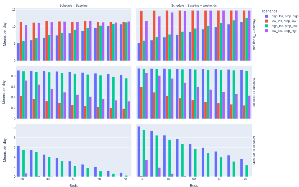
Figure 2: Results of simulations across 30-70 beds, for each of 2 theatre schedules with 4 combinations of lengths-of-stay (baseline:high_los; baseline x0.25: low_los) and proportion delayed (baseline:prop_high; baseline x0.25: prop_low) for mean daily total surgical throughput, bed utilisation, and lost slots.

The results are plotted in Figure 2. The top row displays the mean total daily surgical throughput for each scenario, and for each theatre schedule. The middle row is mean daily bed utilisation. The bottom row displays ‘lost slots’, estimating the extent of the mismatch between patients scheduled and beds available.