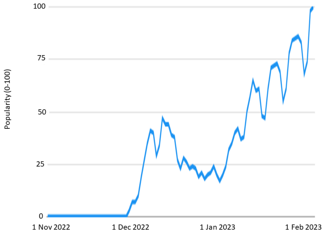
Figure 1. Interest over time for ChatGPT based on Google Trends