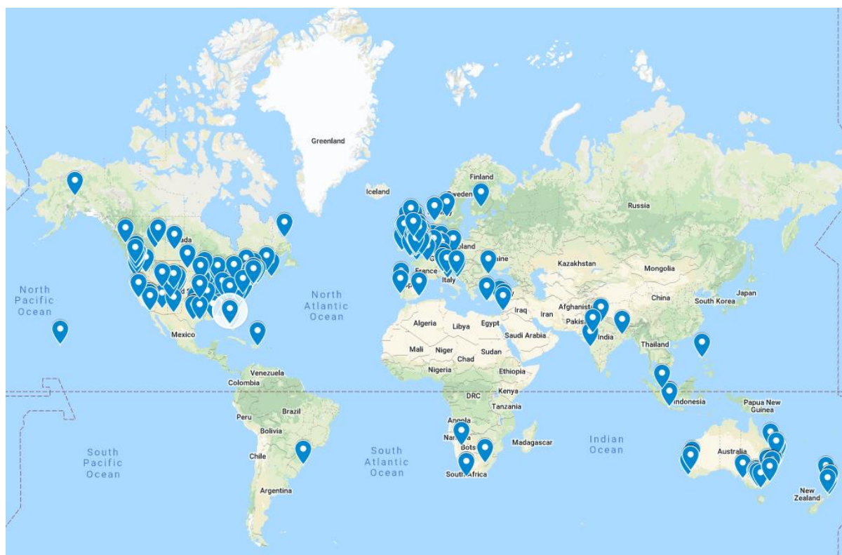
Figure 1: Global distribution of respondents.

The mean age of respondents was 50.1 years (SD 15.6), ranging from 18 to 85 years of age; 292 (65.8%) were female. Most respondents resided in the United Kingdom (n = 245, 55.1%) and the United States of America (n = 103, 23.1%), but responses were received from 29 additional countries ( Figure 1 ). In total, 432 (98.2%) had completed mandatory education. Over half of respondents (n = 241, 54.3%) were married. A range of current employment statuses were reported: 182 (40.9%) were in some form of unemployment with over a quarter unemployed (n = 122, 27.4%).