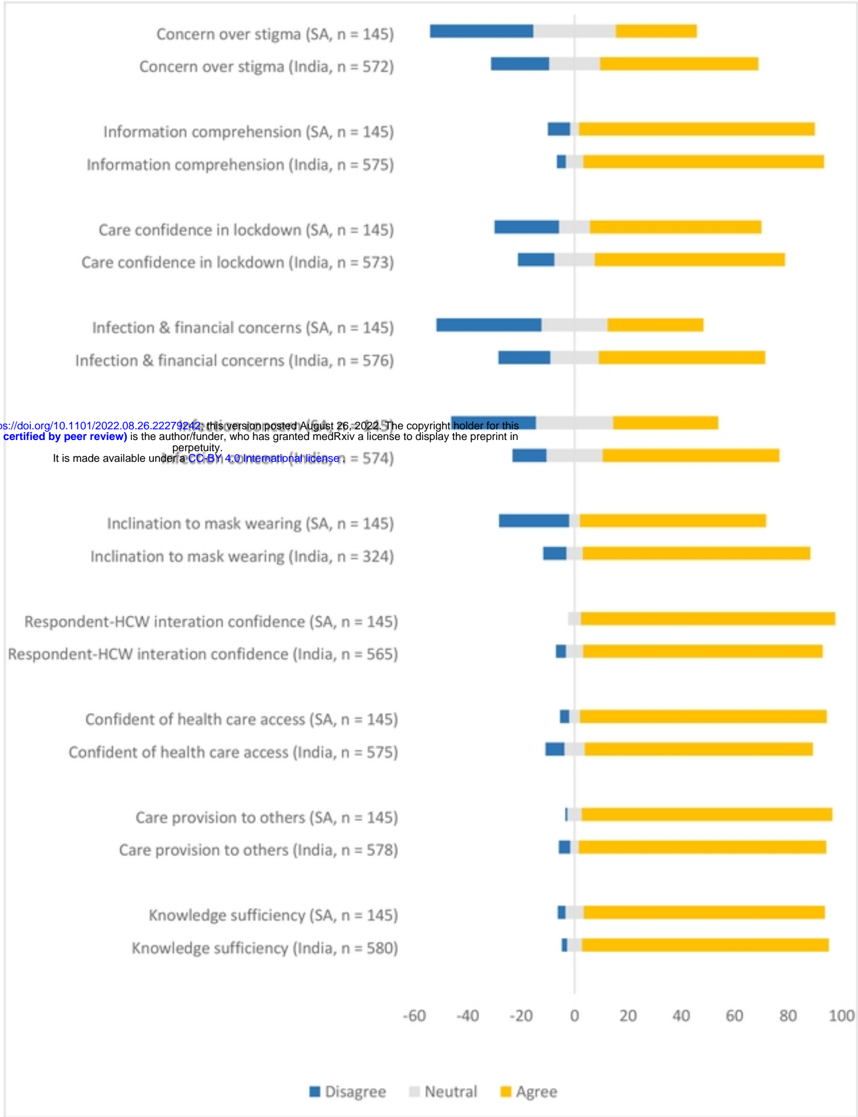
Figure 2 Respondents' perceptions of self-efficacy in relation to coping with the COVID-19 pandemic in South Africa (SA) and India

medRxiv preprint doi: https://doi.org/10.1101/2022.08.26.22279242 ; this version posted August 26, 2022. The copyright holder for this preprint (which was not certified by peer review) is the author/funder, who has granted medRxiv a license to display the preprint in perpetuity. It is made available under a CC-BY 4.0 International license .