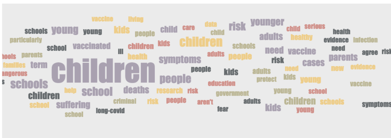
Figure 2: Keywords Word Cloud by emotion in Long COVID CYP analyses