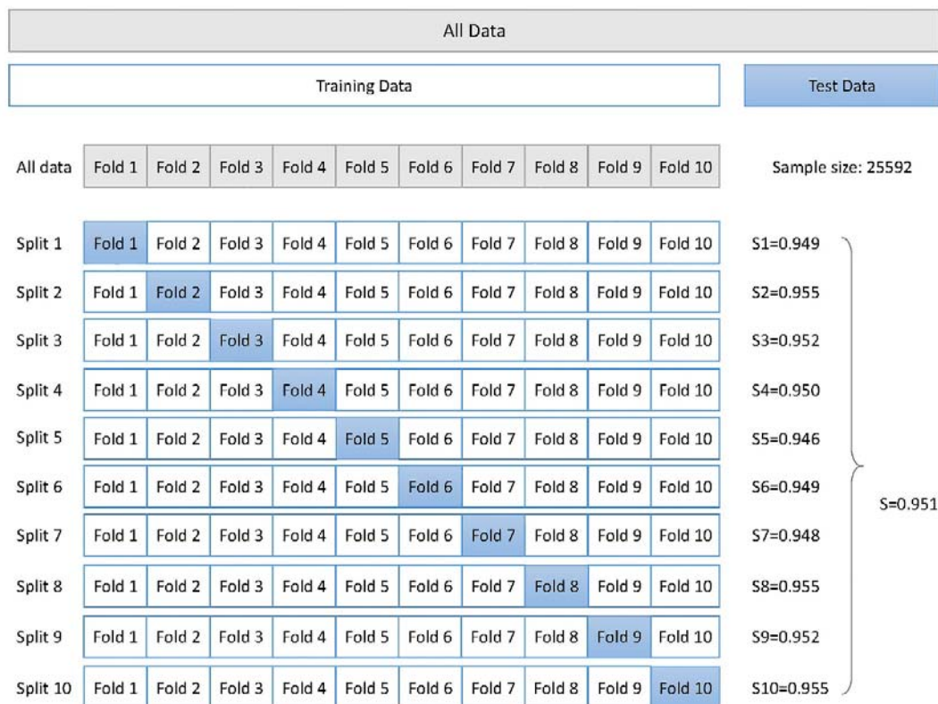
Figure 3. Ten-fold Cross Validation