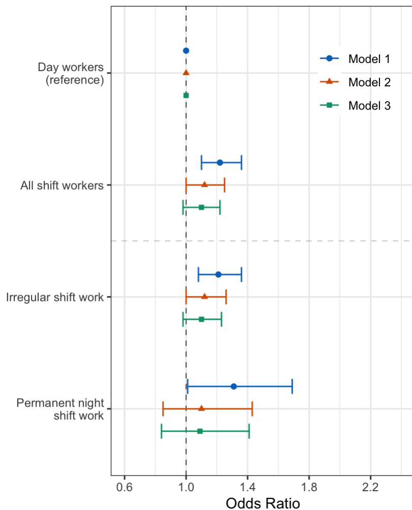
Figure 2. Adjusted odds of rheumatoid arthritis in shift workers (n=286,825)

Forest plots of adjusted OR and 95% CIs for RA in all shift workers and shift workers stratified by current shift pattern, with day workers as a referent population. Three multivariate logistic regression models were used. Model 1 (circle): age, sex, ethnicity and Townsend Deprivation index; Model 2 (triangle): sleep duration, alcohol intake, smoking status and length of working week, plus model 1 covariates; Model 3 (square): BMI in addition to model 2's covariates.