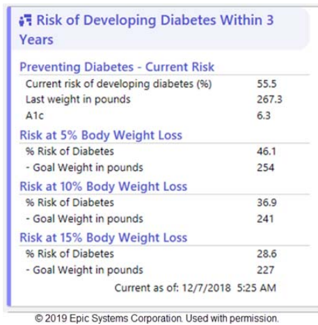
Figure 1. Diabetes Risk Calculator

Effective preventive interventions like the DPP and medications are critical to prevent or delay type 2 diabetes, but awareness of prediabetes and the potential for risk reduction are prerequisites to activating a preventive intervention. We have previously described an algorithmic-based Diabetes Risk Calculator (Figure 1) to communicate a personalized baseline risk of developing diabetes in three years. 12 Accordingly, we demonstrated