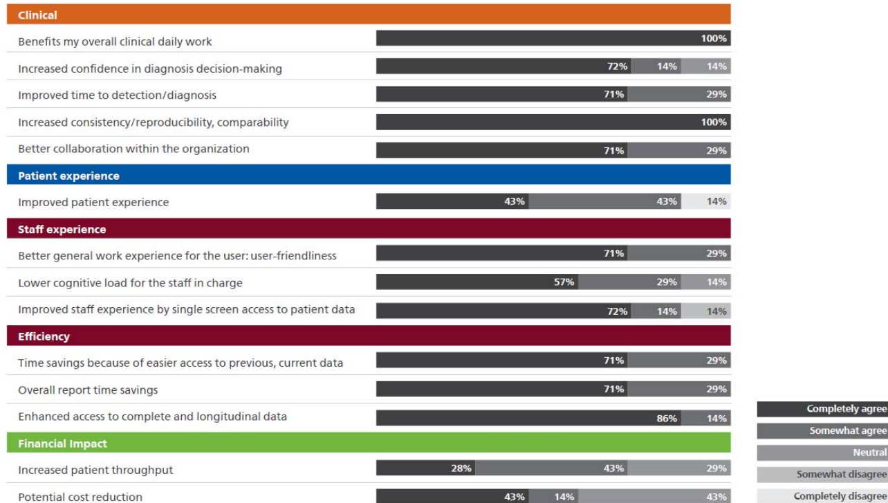
Figure 4: Responses to 5-point Likert-style questions. Participants were asked to assess the Echo Workflow Solution in comparison to a situation in which they did not have the full Echo Workflow Solution. Percentages are rounded up to the nearest digit.