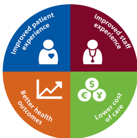
Figure 1. The Quadruple Aim. 4