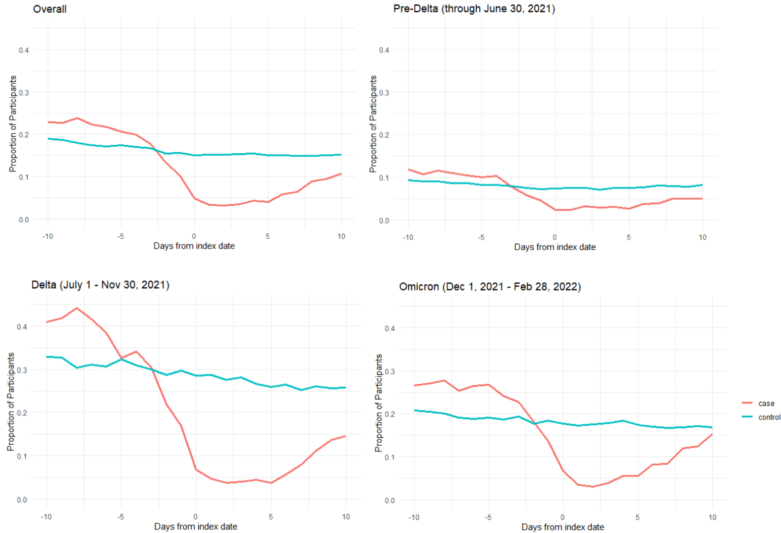
Figure 1. Proportion of Participants Responding to Daily Survey that they did not wear a face mask or face covering every time the interacted with others preceding and following match date (Day 0), by variant-predominant period