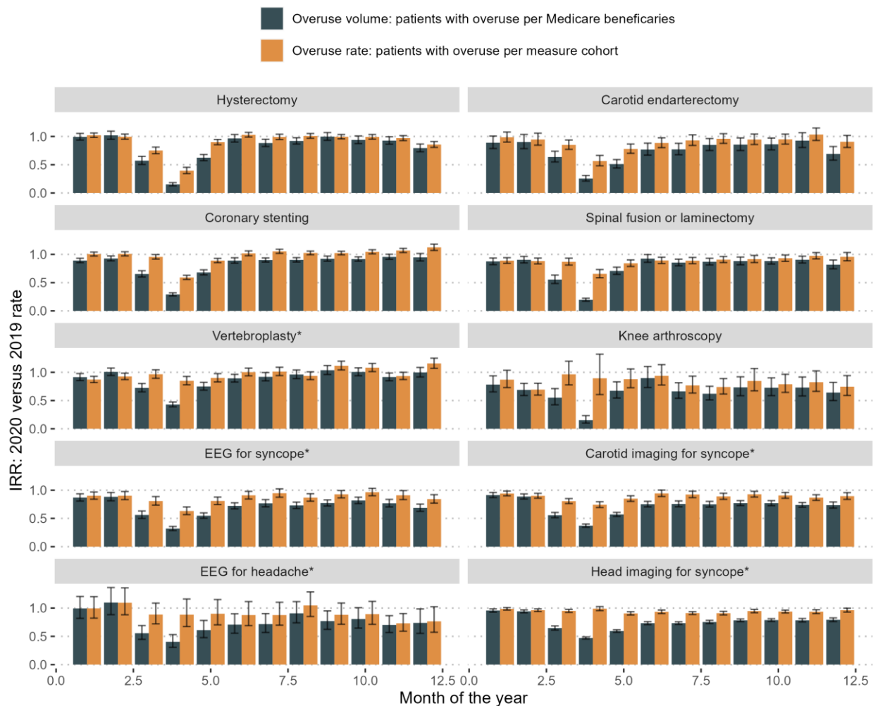
Figure 1. Monthly 2020 versus 2019 incidence rate ratios for overuse measures.

The monthly incidence rate ratios (IRRs) for the number of patients with an overuse service per Medicare Fee-For-Service beneficiary (left panel) and per measure denominator cohort (right panel) in 2020 compared to 2019. *Measures where the cohort is defined as claims for patients with a certain condition are marked with an asterisk (vertebroplasty, EEG for syncope, carotid imaging for syncope, head imaging for syncope and EEG for headache patients). Other measures define the cohort as all patients with the specific service. IRRs and 95% CIs (error bars) were estimated from Poisson regressions by comparing total beneficiary counts during epidemiologic weeks in 2020 with corresponding weeks in 2019.