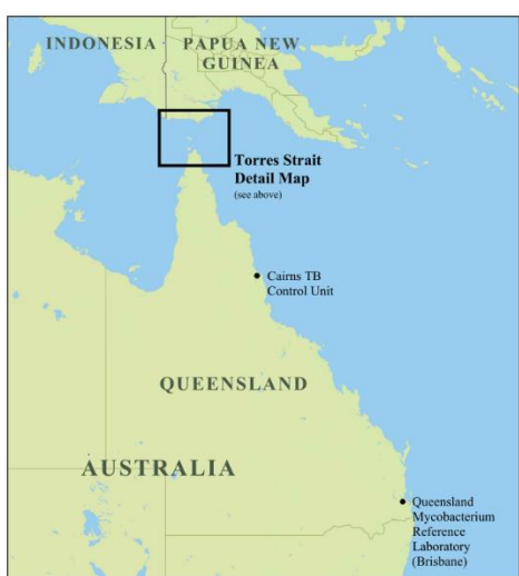
Figure 1. Map of A) the Torres Strait / Papua New Guinea cross-border region and B) relevant tuberculosis referral centres in Queensland, Australia. CC BY 4.01