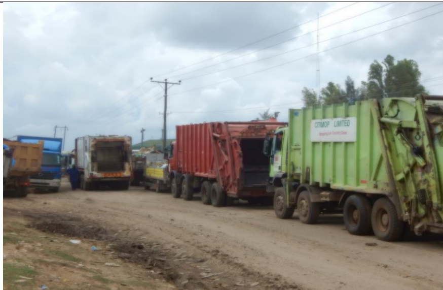
Fig. 2 Loaded refuse trucks near houses marooned at the dumpsite.

Source: Researchers,( 2018) adopted from (ISWA, 2015 and WHO, 2000).