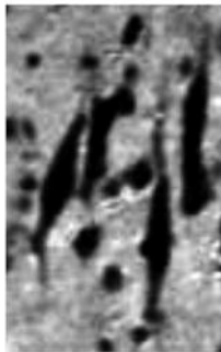
VENs in ACC