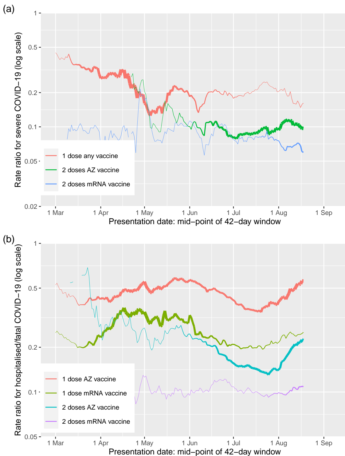
Fig 1. Relation of vaccine efficacy to calendar time: (a) severe COVID-19 (single-dose categories for AZ and mRNA vaccines have been combined as the numbers of events in those with 1 dose of mRNA vaccine were small); (b) hospitalised or fatal COVID-19. Rate ratios in conditional logistic regression model, adjusted for covariates. For each effect, line thickness is proportional to precision of estimate.