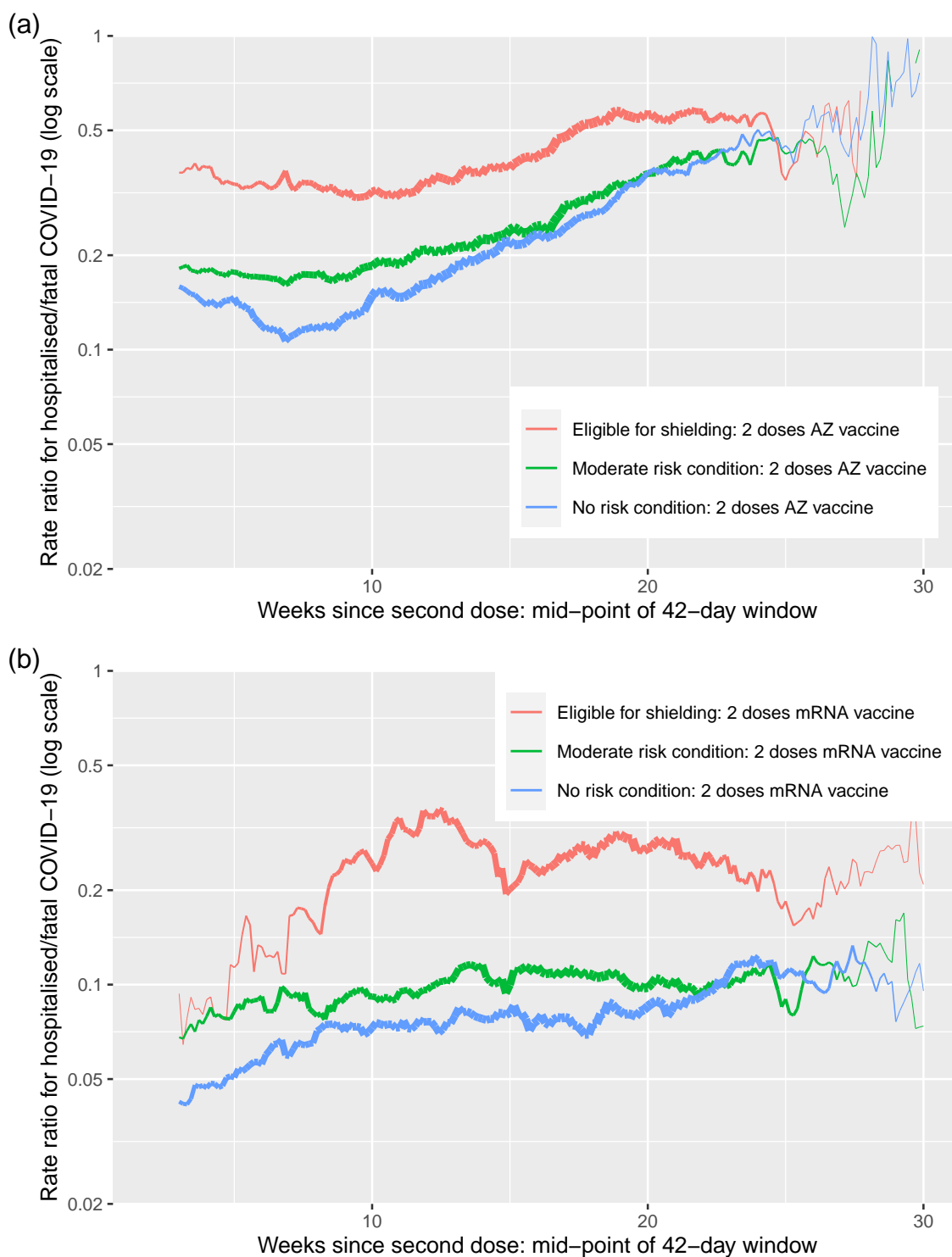
Fig S1. Relation of efficacy of two doses of vaccine against hospitalised or fatal COVID-19 to time since last dose by risk group: (a) AstraZeneca vaccine; (b) mRNA vaccines. Rate ratios in conditional logistic regression model, adjusted for covariates. For each effect, line thickness is proportional to precision of estimate