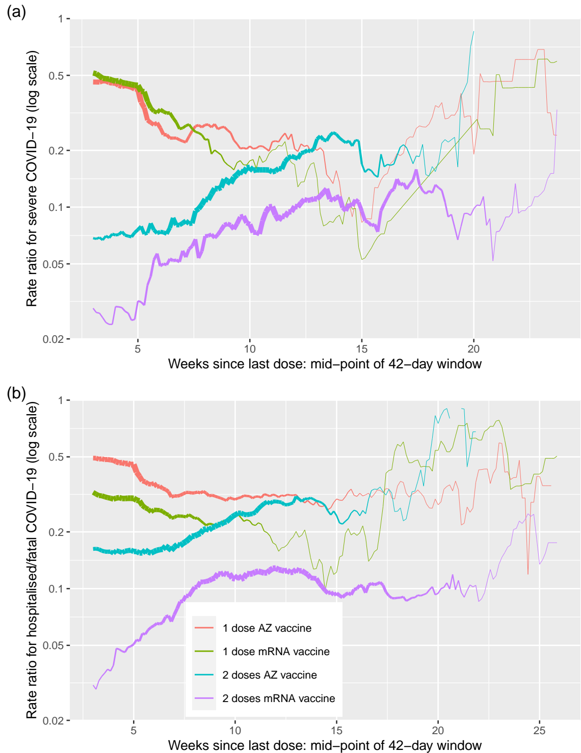
Fig 2. Relation of vaccine efficacy to time since last dose: (a) severe COVID-19; (b) hospitalised or fatal COVID-19. Rate ratios in conditional logistic regression model, adjusted for covariates. For each effect, line thickness is proportional to precision of estimate

It is made available under a CC-BY-NC-ND 4.0 International license .