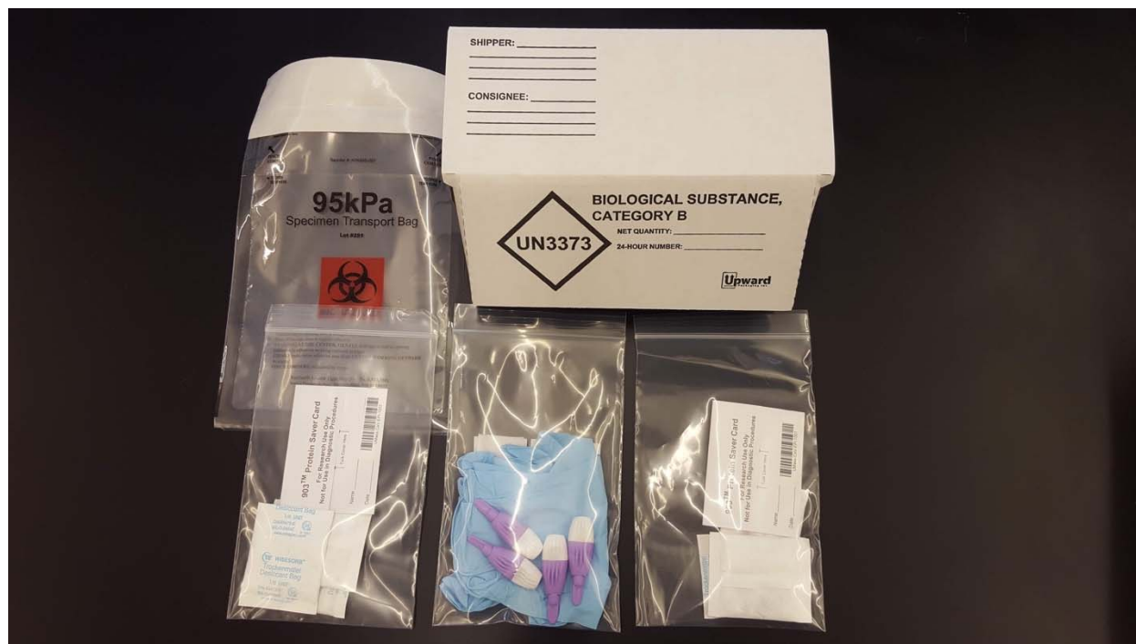
Figure 2: Participant enrollment diagram, SARS-CoV-2 serosurvey, Massachusetts, USA, Jul-Aug 2020

Each box mailed to a household contained: DBS cards with barcodes, two silica packets per DBS card, collection supplies (gloves, lancets, gauze, alcohol pads, and adhesive bandages), biospecimen bags, return labels, tape to seal the box for return, and instruction sheets for how to collect the sample and how to close the biospecimen bag.