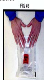
Figure 5: shows the middle finger of both hands being used to press the adhesive together. Start at the center of the fold and work outward. Please be sure to firmly press the entire adhesive area, especially the folded edge and corners. PRESS FIRMLY AT THE CORNER AREAS INDICATED BY THE ARROWS.

This is a high performance bag. Thank you for making the effort to close it properly.