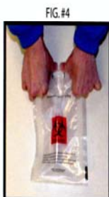
Figure 4: shows the bag after the top is folded at the slit opening and the thumbs pressing the folded end of the bag.