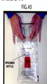
Figure 3: shows the bag after the paper adhesive cover has been removed and with the middle fingers touching the adhesive at the middle of the bag below the slit opening. It also shows the thumbs under the end of the bag ready to fold the top of the bag over.