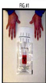
Figure 1: shows the bag laying flat on a counter with the tape side up and the tape end towards the person closing the bag.