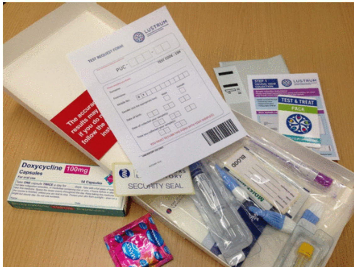
Figure 2: The APT Test and Treat Pack

The APT pack is packaged in a plain white box with no markings or identifiers and contains: antibiotics; condoms; Limiting Undetected Sexually Transmitted infections to RedUce Morbidity TEST & TREAT leaflet; vulvo-vaginal swab kit or urine sampling kit; blood sampling kit; instruction leaflet for sampling kits; test request form for sample processing; prepaid return post envelope; security seal sticker; attention card